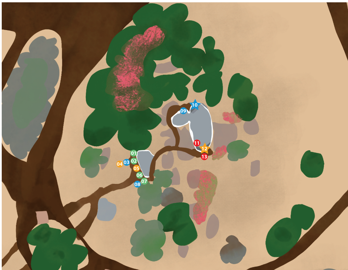
Figure 2: RPC Mr. Longarm Topo

I will warn you again, BE CAREFUL OF POISON OAK! You are only immune until you are not, they you will be riddled with it. There is tons of it around the north cluster, I have marked a few sections in the topo with pink splatter, but there is a lot of it, and it probably changes year to year.