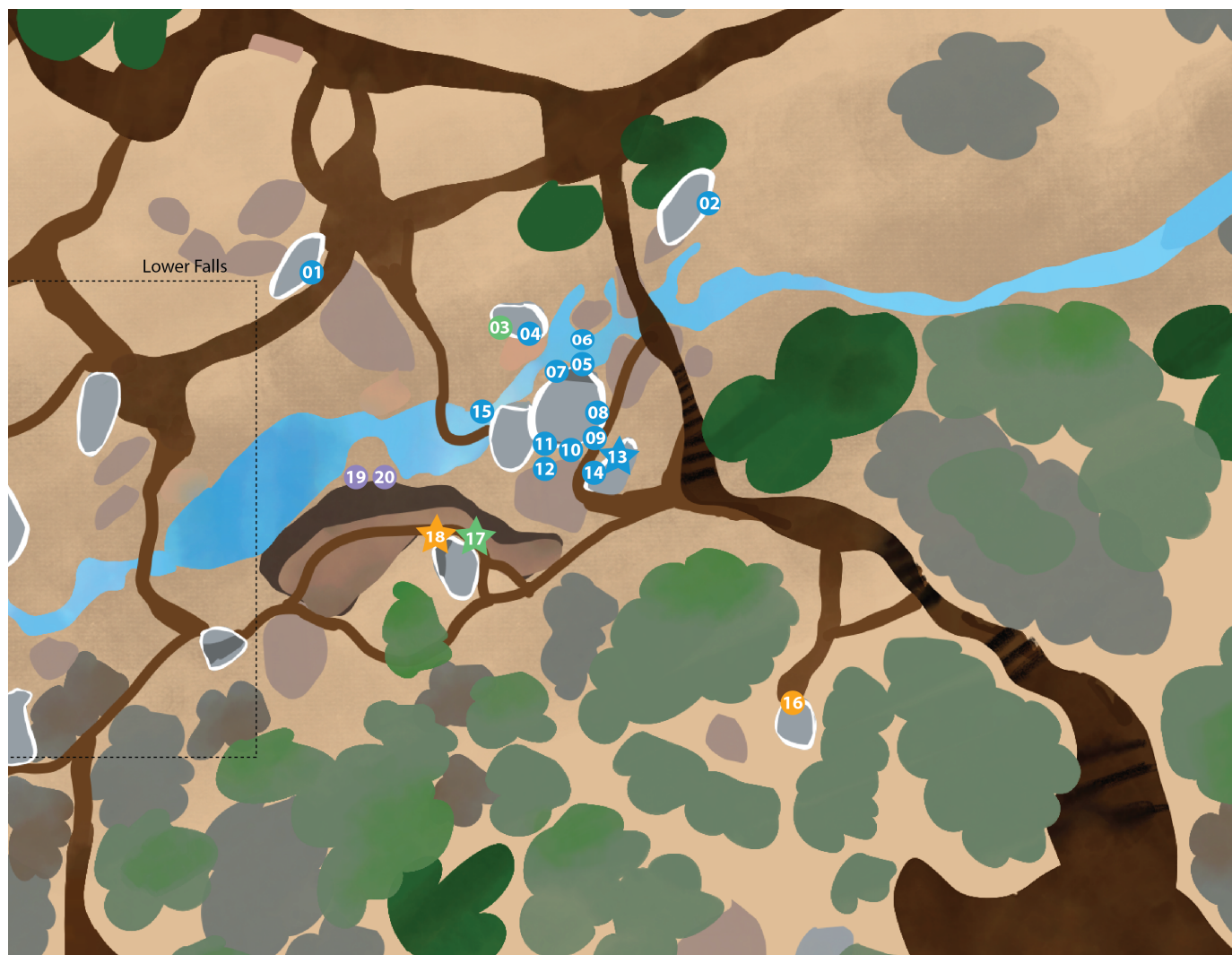
Figure 3: RPC Main Falls Topo