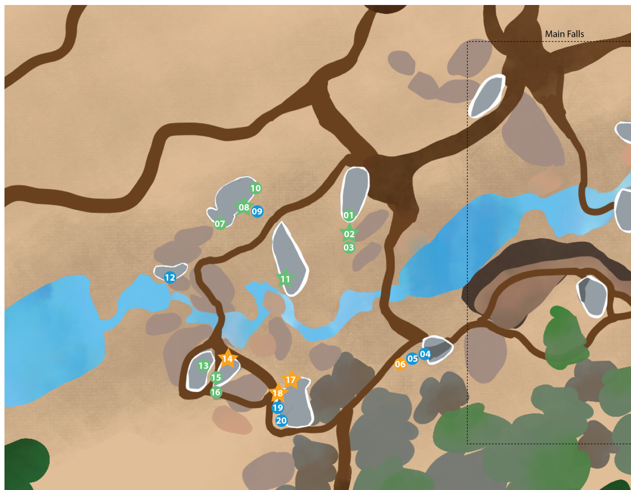
Figure 4: RPC Lower Falls Topo